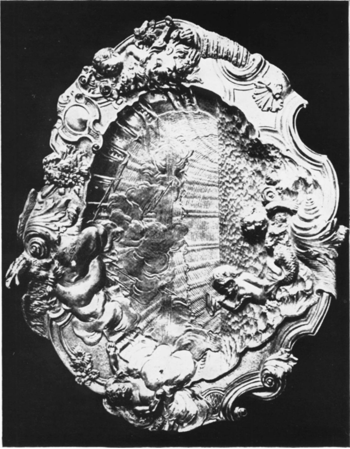
34. Gilt bronze dish , here attributed to Paul de Lamerie. (Museum of Art, Cleveland.)