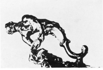
35. Handle of ewer , by Paul de Lamerie. Hall-marked 1741. (Goldsmiths' Hall, London.)